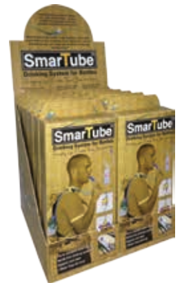
12 units Counter Display (open) (24x24x50cm)