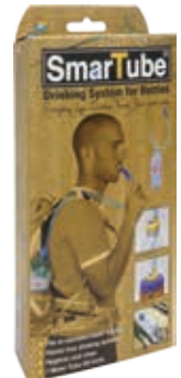
Single Pack (11x3x24cm) ITEM #0936 SmarTube®