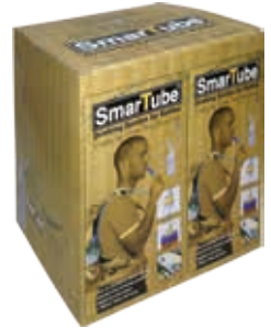
12 units Counter Display (closed) (24x24x28cm)